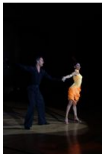
Samba dancers on a stage

Originating from Brazil, Samba has grown to become a popular dance form associated with Rio de Janeiro's Carnival. It is filled with rhythm and voluptuous dance moves. While its history is centered around Rio de Janeiro, the genre evolved into a new form in the 1980s as artists in Salvador created a new style that was slower and more driving. Musicians use a variety of percussion instruments to make this rhythmic style of music.