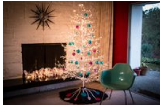
How to Make a Vintage-Inspired Christmas Tree Skirt