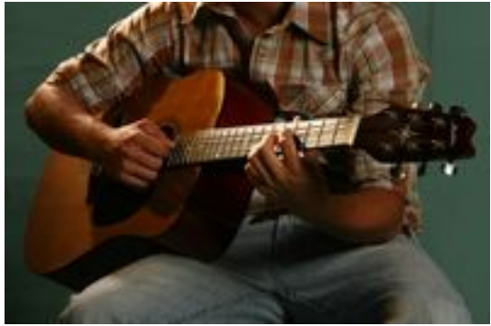
Latin Jazz Instruments