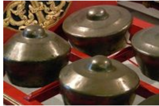
What Instruments Are Used in Gamelan Music?